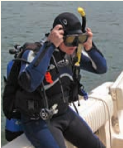
PADI/NAUI: 111 certifications so far!