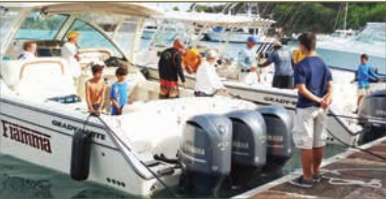
CREWS FROM ST. JOHN'S, ANTIGUA, DEALER OUTDOOR WORLD prepare to head out from The Nelsons Dockyard to fish the annual Antigua Barbuda Sport Fishing Association tournament, a major three-day angling and social event complete with live music, seafood stalls and fun games for the entire family.

It's showtime! For a list of winter boat shows visit www.gradywhite.com . See you there!