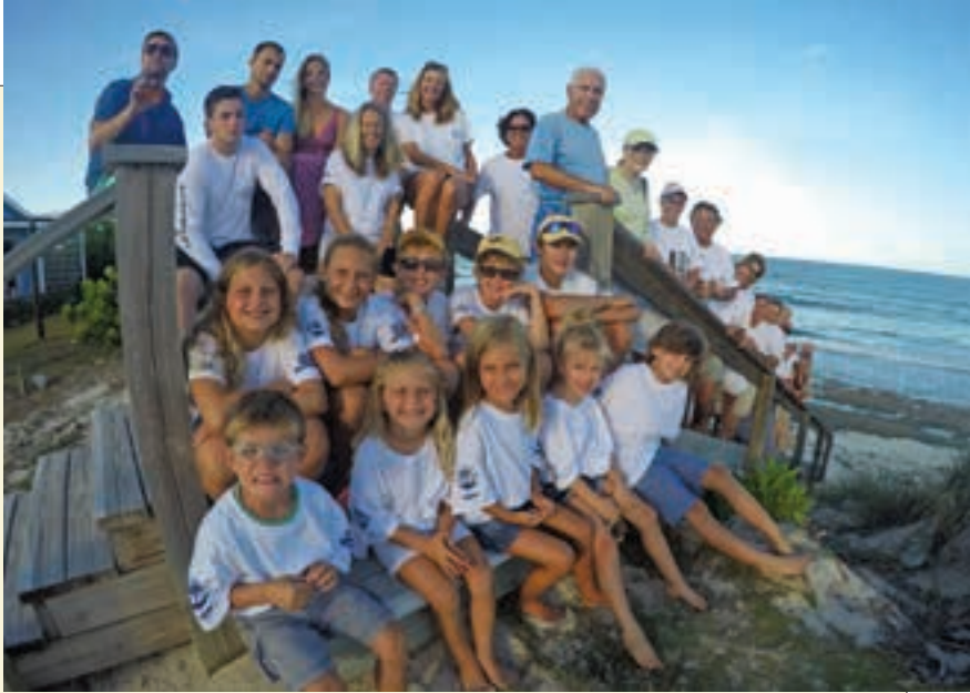
28th Annual Bahamas Cruise