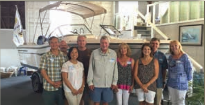
SCHOCK BOATS, NEWPORT BEACH, CA, celebrated its 70th Anniversary in July with a Customer Appreciation Day. Tacos and Grady Gear helped make it a party!

Grand Pointe Marina of Detroit & Lansing, Michigan Strong's Marine , Freeport, NY MarineMax East , Miami, FL