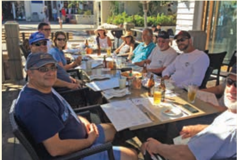
WELCOME, SCHOCK BOATS GRADY CLUB! Fifteen Grady-White owners attended their first club outing to Avalon, on Catalina Island. The club is sponsored by the Newport Beach, CA, dealership.

Here are highlights from recent Grady Owners' Clubs events and outings. If you have Grady club information to share or are interested in information about Grady clubs in your area, email anchorline@gradywhite.com . Go to www.gradywhite.com for links to club websites.