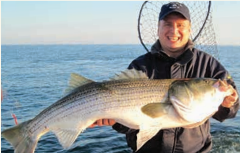
ALWAYS CATCHING huge Hudson River striped bass!