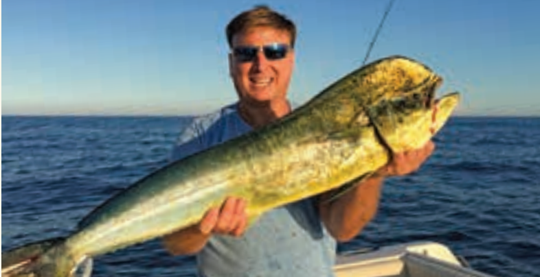
AUGUST 2016 mahi-mahi were schooling under his Marlin 300.