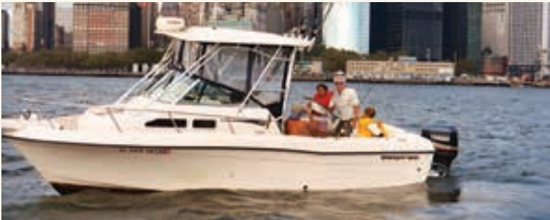
NEW YORK HARBOR in a Gulfstream 232, purchased 2004