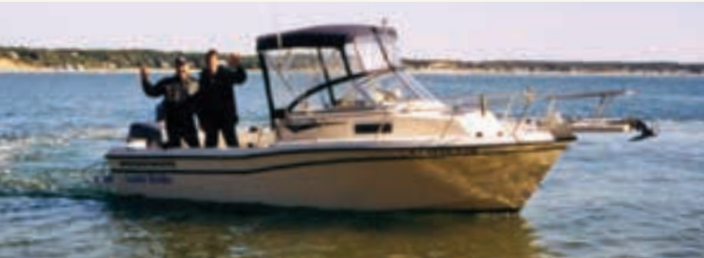
FIRST GRADY—a 1998 Adventure 208