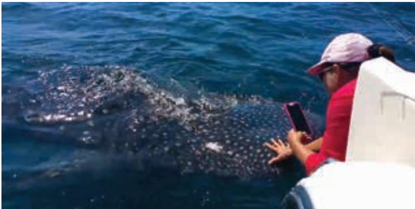
ADOLFO AND EVELYN SALAZAR were greeted by a whale shark while on their 2017 Canyon 271 FS about 30 miles off Naples, FL. This sea creature, the largest living fish on the planet, knows a good thing when he sees it!