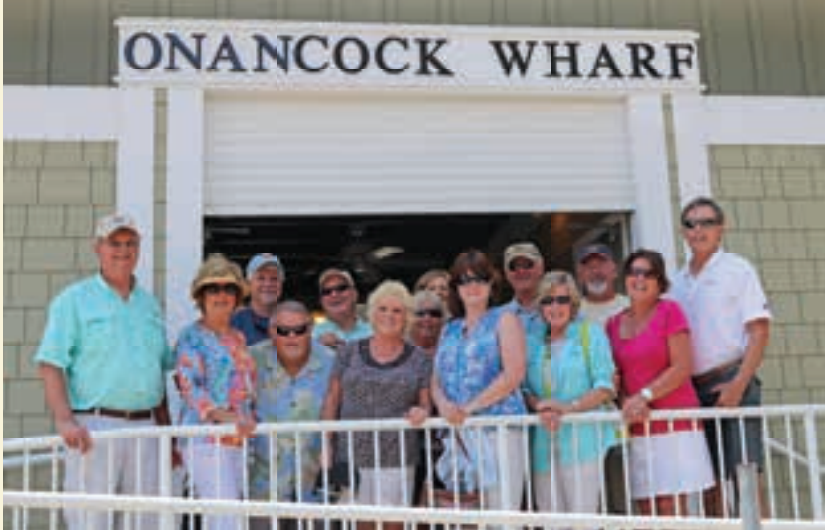
THE SOUTHEASTERN MARINERS cruised from Deltaville to Onancock, VA, this summer, fulfilling a long-planned club excursion across the Chesapeake Bay.

Onancock. Despite trailing seas of three feet on the trip across, the Mariners had a wonderful cruise and enjoyed a leisurely tour of the historic maritime town, relaxing lunch at Mallard's on the Wharf and great camaraderie. All were blessed with an easy afternoon cruise back home. A great cruise destination if you have the opportunity! Southeastern Marine of Richmond, VA, sponsors this group.