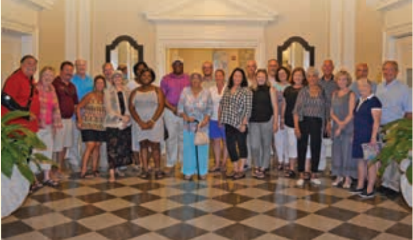
The TIDEWATER GRADY-WHITE CLUB enjoyed the spectacular buffet at the historic Chamblin Hotel at Fort Monroe, Hampton, VA. Six Gradys made the trip from Lynnhaven Inlet to the Old Point Comfort Marina next to the hotel. The day was probably the most beautiful of the summer!